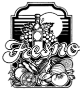
Exhibit Hall III Fresno Convention & Entertainment Center 848 M Street, Fresno, CA 93721